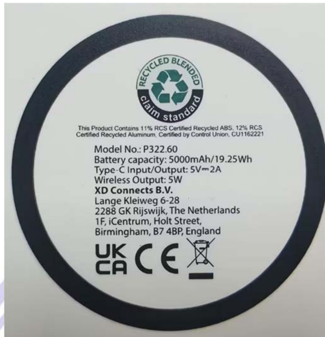
Photo5 Label view 标签视图