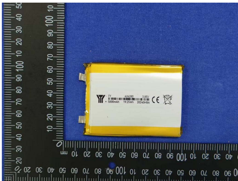
Photo 3 Internal Cell 内部电芯