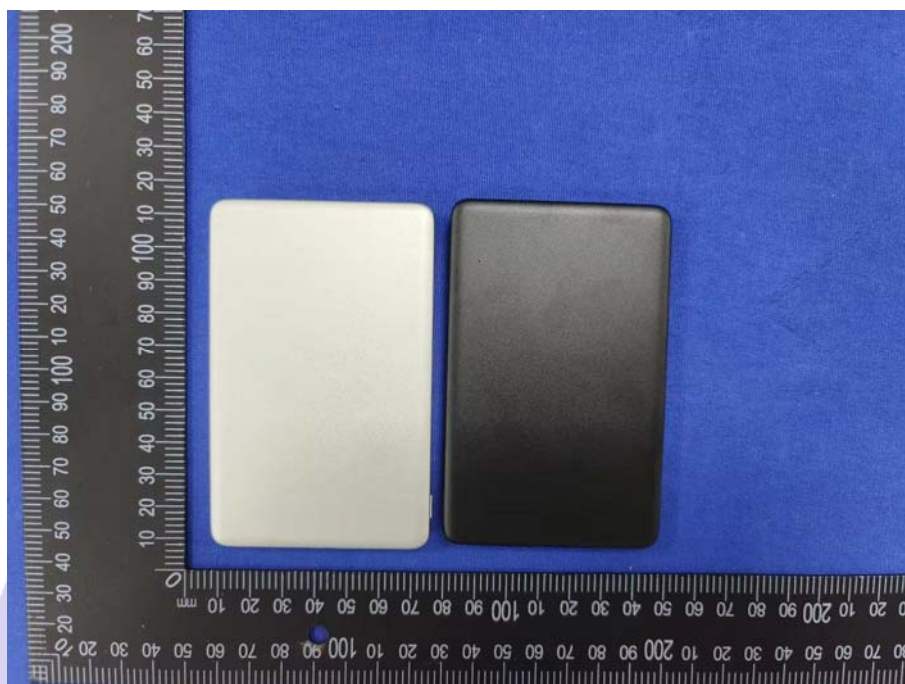
Photo 1 Front 正面