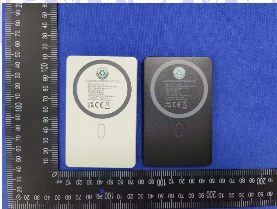
Photo 2 Rear 反面