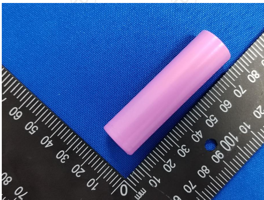
Picture 4. Cell view