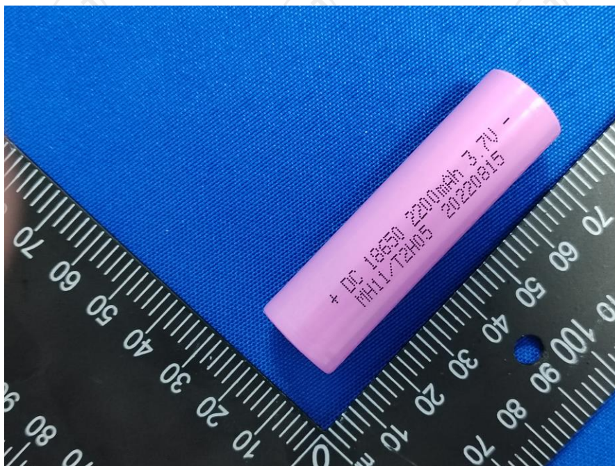
Picture 3. Cell view