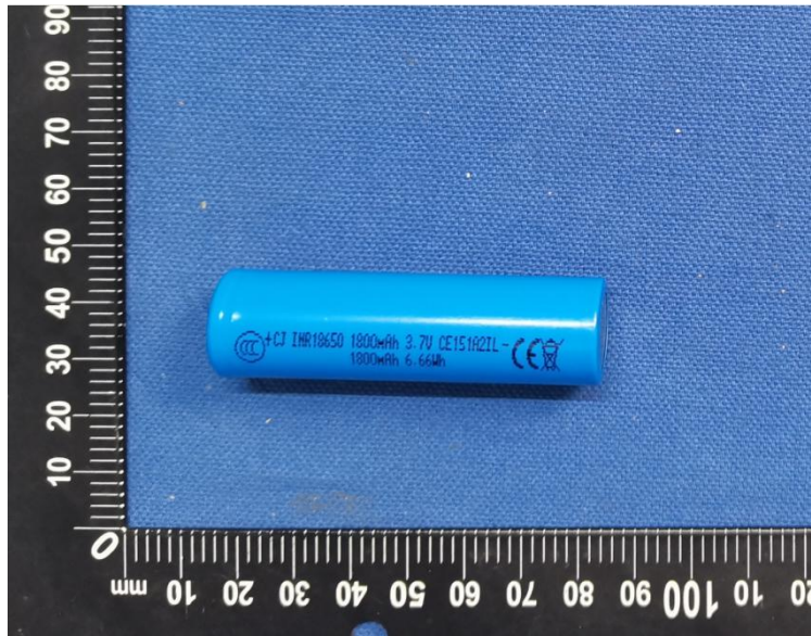
照片 1: 电池芯 Photo 1: Cell